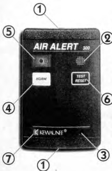
Figure 1: Front view of instrument

The Kewaunee AirAlert 300 monitor is designed to continuously monitor airflow through fume hoods. This permanently installed device provides both visual and audible alarms to alert the user of abnormal airflow conditions after the instrument is calibrated for the particular installation. A green indicator on the front of the monitor indicates normal flow conditions. When flow conditions lower than the setpoint are encountered, a red indicator is activated along with an audible horn. A test button is provided at the front of the monitor to allow the user to check the operation of the alarm. See Table 1 for a description of each key function located on the front of the monitor.