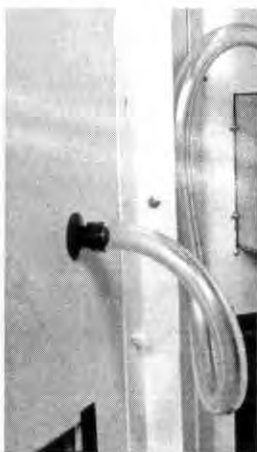
Figure 4: Rear view of fascia